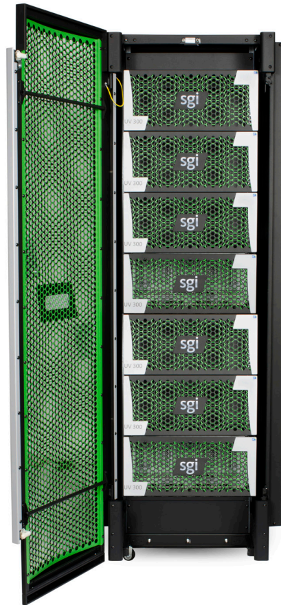
32-socket SGI UV 300

Industry-standard PCIe Gen3 expansion slots provide countless options for persistent storage with fast I/O, very-high bandwidth connectivity. For hardware, select from the entire SGI InfiniteStorage line of Storage Servers, RAID and tape libraries, as well as industry-standard 3rd party components. For storage software, leverage Intel® Enterprise Edition for Lustre, SGI CXFS™, or industry standard XFS® file systems, SGI XVM® volume management, SGI DMF™ tiered data management, and 3rd party backup solutions.