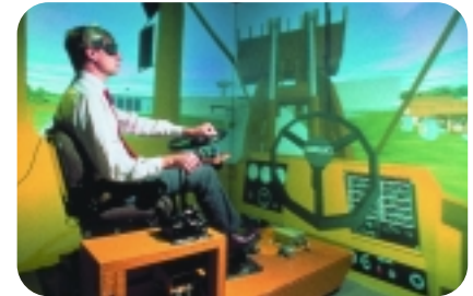
Above: Caterpillar's use of CAVE™ in a virtual prototyping environment

More information is available on our Professional Services Web site at www.sgi.com/services/ or by calling 1(800) 800-7441 [U.S. and Canada].