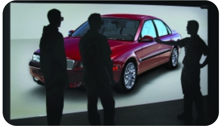
Above: Volvo customers using virtual prototyping software

SGI Professional Services assumes total project responsibility for the ultimate success of your visualization solution, eliminating your exposure to risk. An in-depth knowledge of current